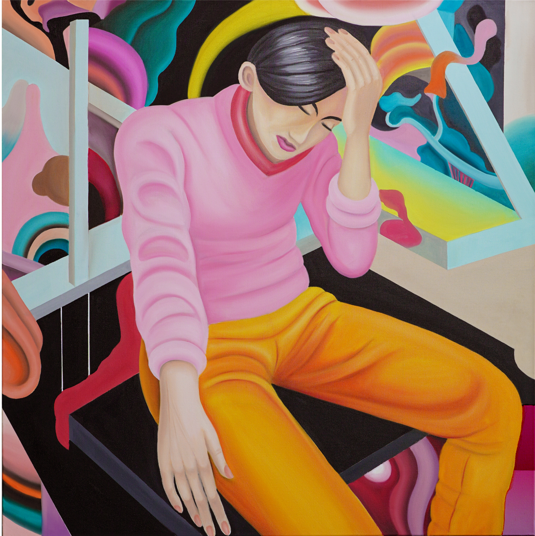
Title - "Tired commuter" Year - 2024

Medium and surface - Oil on canvas Dimensions - 100 x 100 cm