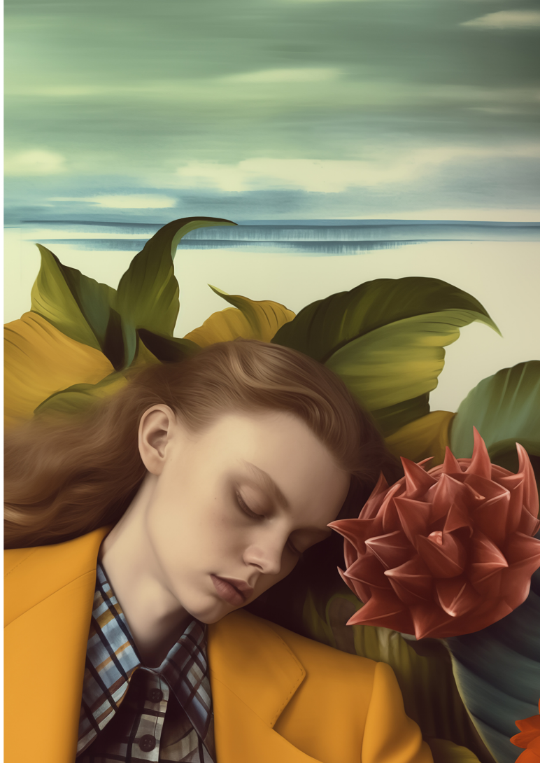
Title - "Yellow bloom" Year - 2025

Giclée unique print on Hahnemühle German Etching paper, archivally mounted and framed. 60 x 84 cm