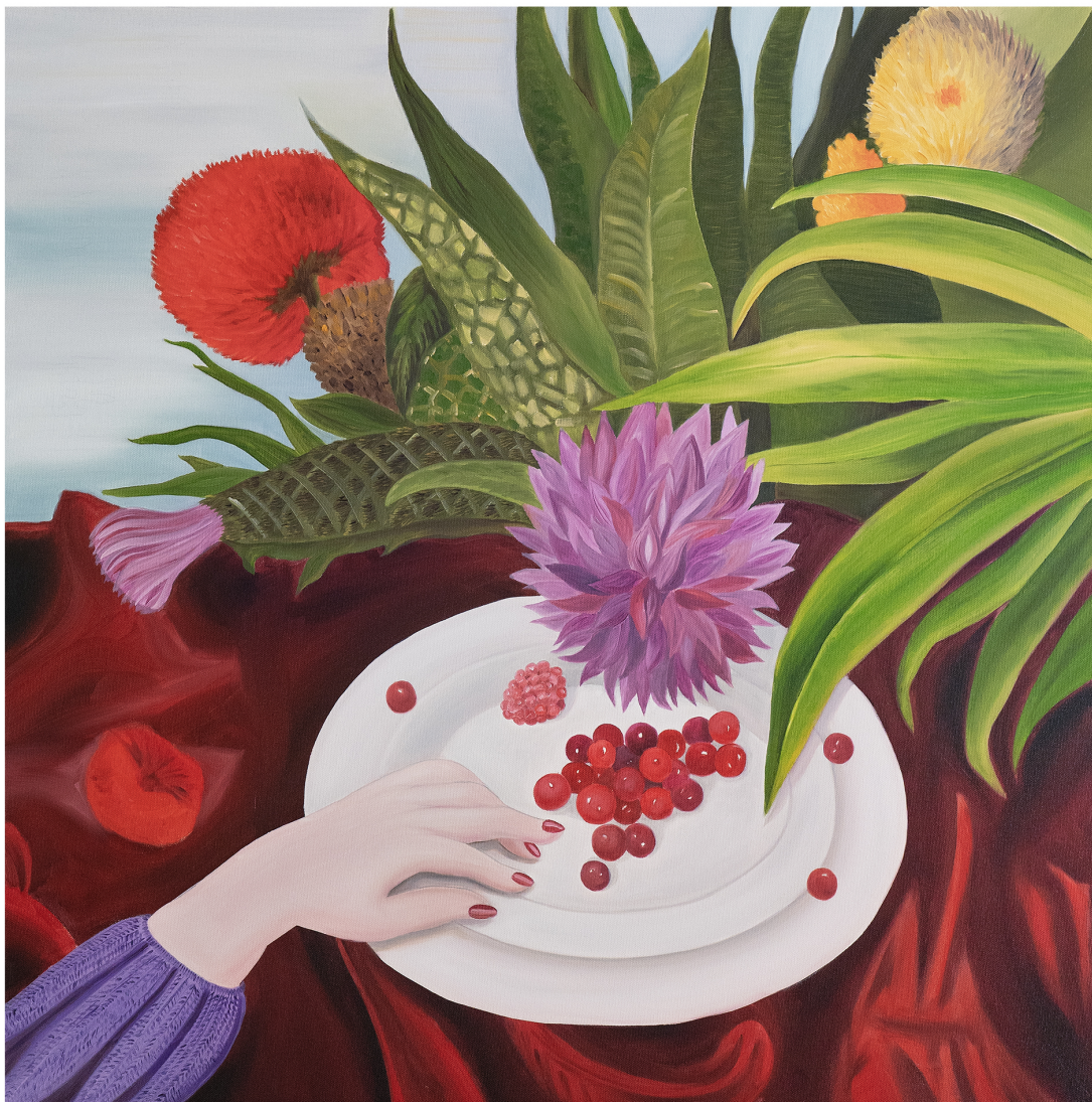
Title - "Composition of red and green" Year - 2025

Medium and surface - Oil on canvas Dimensions - 76 x 76 cm