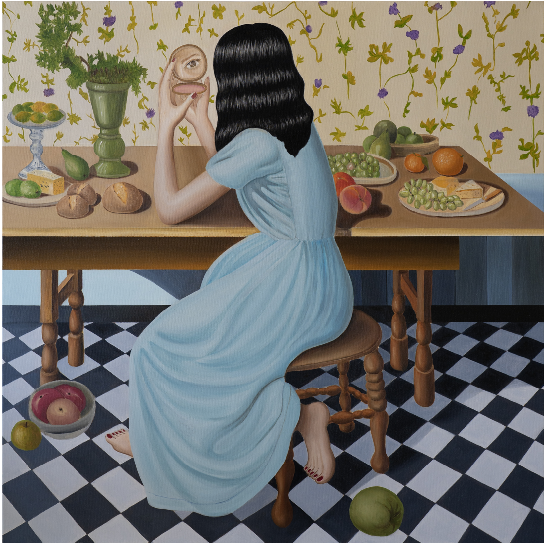
Title - "Liminal" Year - 2025

Medium and surface - Oil on canvas Dimensions - 76 x 76 cm